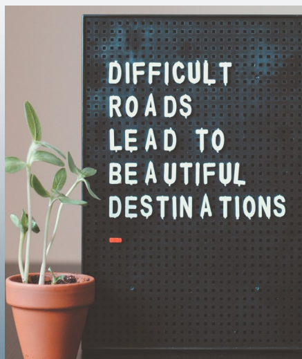
Career in STEM