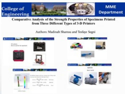
Design and additive manufacturing